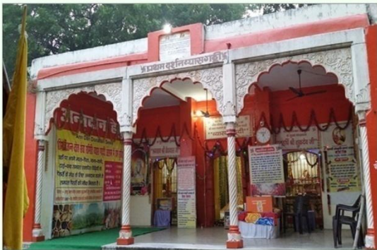
Vyas Gaddi 33 Km from Venue