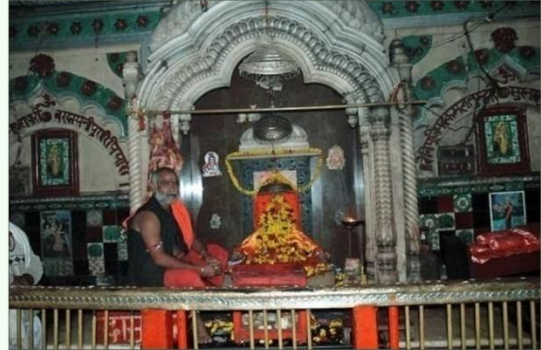
Lalita Devi Temple 33 Km from Venue