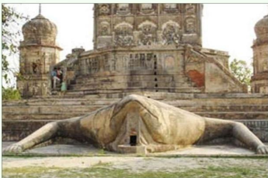
Medhak Mandir 38 Km from Venue