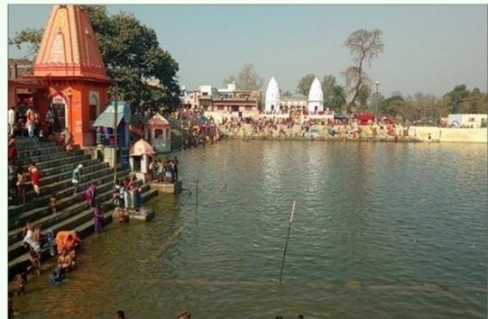
Dadhichi Kund 22 Km from Venue