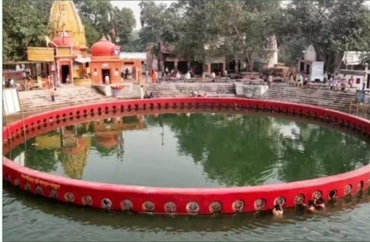
Chakratirth 33 Km from Venue