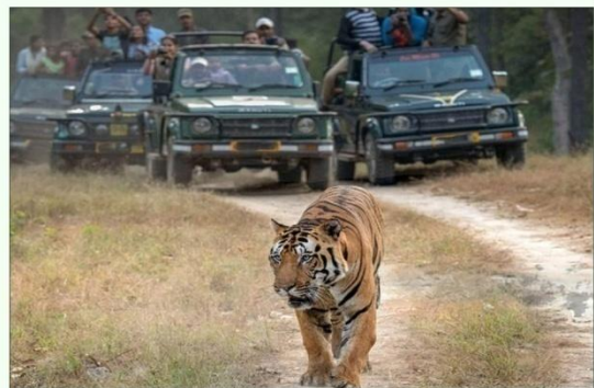
Dudhwa National Park 136 Km from Venue